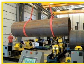
Each section loaded onto rolls.

* 208 - 600V, 50 or 60 Hz input power options available. Specifications subject to change; consult factory for all specifications.