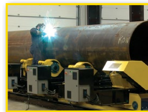
Ready for fit up and/or automated welding, then index for next section to be added.