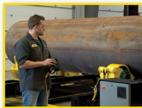
Alignment, leveling and high/loos easily adjustable using pendant or touch screen control.