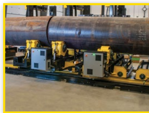
Sections brought together using powered track drive.